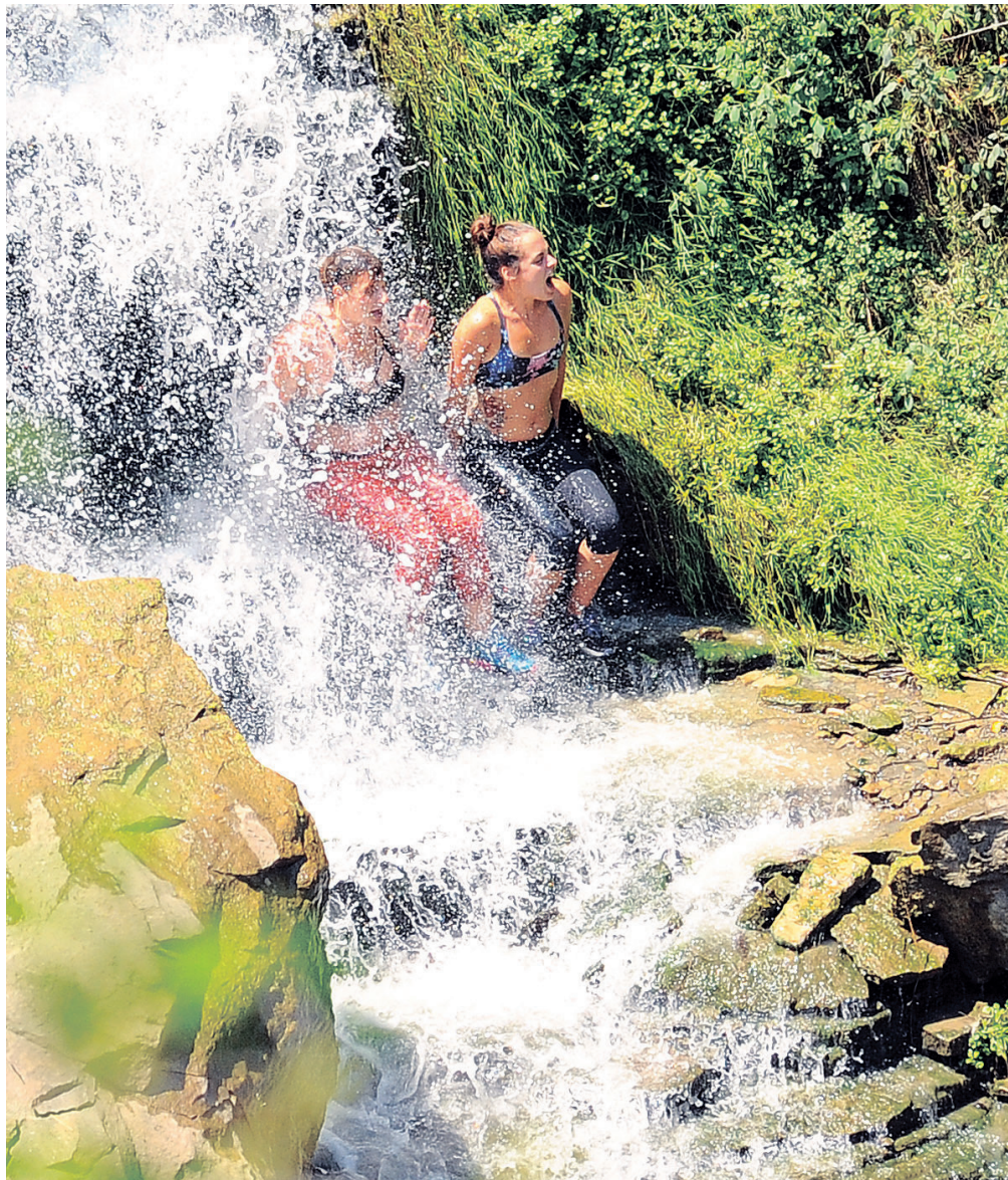
Two women sit in the cascading water at Albion Falls on Aug. 8. The City of Hamilton considers anyone entering the water at the east Mountain natural site to be trespassing. Water test results over the years show Albion Falls water is probably not something you want to bathe in.