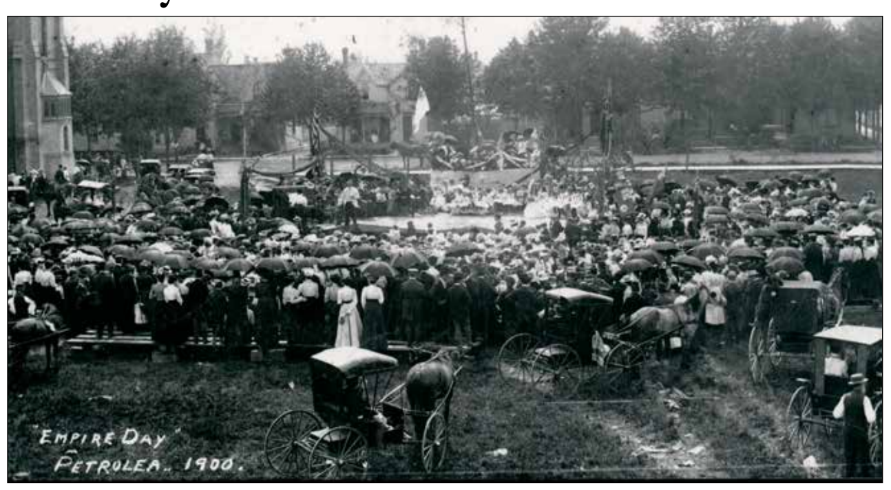
Empire Day in Petrolea – notice the date because the picture is from 1900. Empire Day started in the early 1890s and today is celebrated as Victoria Day. This scene is Princess St. South behind the Presbyterian Church. The crowd may be standing where Canada Post stands today. Some of the houses in the background still exist today.