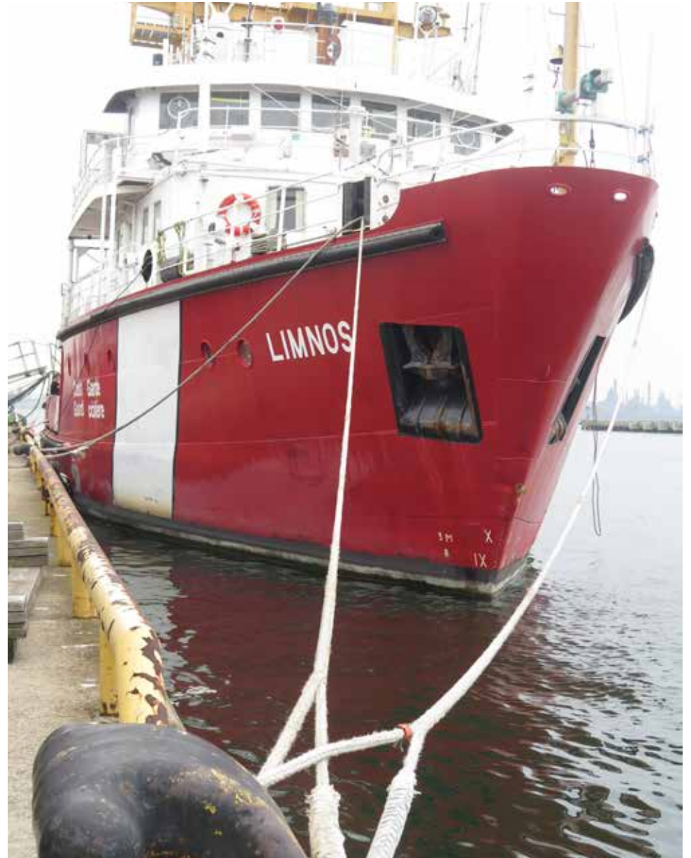
Limnos, the only Canadian government-operated research ship on the Great Lakes, ties up at the Canada Centre for Inland Waters (CCIW) in Burlington. The vessel is celebrating its 50th birthday.