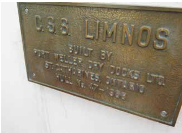
A bronze plaque indicates the ship was launched in 1968.

Established in 1967, CCIW accommodates over 600 staff from Environment Canada (EC), the Department of Fisheries and Oceans, the Canadian Coast Guard, and the Royal Canadian Mounted Police.