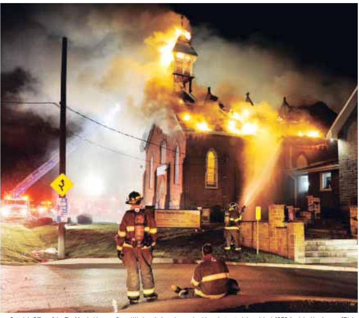
Ontario's Office of the Fire Marshal has confirmed Wednesday's early-morning blaze that gutted the original 4372 Appleby Line home of Trinity Baptist Church was arson. The building had been the former Zimmerman Methodist Church built in the early 1890s. According to Trinity Baptist Church's website its congregation purchased the property from the United Church in 1975.