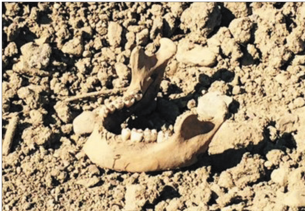
The remains found in May resulted in a full dig in front of a new home on Cabrelle Place.