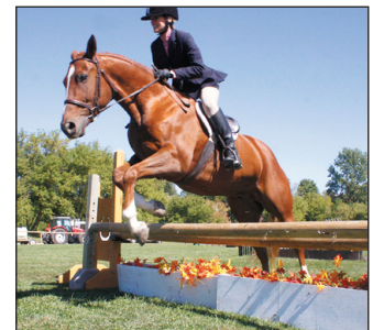
FALL FAIR FEVER Residents, organizers prepare for New Hamburg Fall Fair Page 3