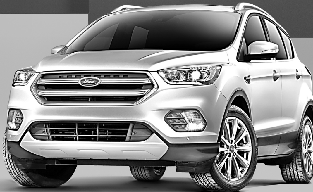
ALLISON, Ford of Canada Employee

PLUS, ELIGIBLE COSTCO MEMBERS RECEIVE UP TO AN ADDITIONAL $1,000 †† ON MOST 2017 AND 2018 FORD MODELS