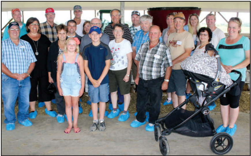
CALEDONIA—Shown are members of the Ontario Federation of Agriculture and the Haldimand Federation of Agriculture on a tour of Haldimand County farms on August 13, 2017.