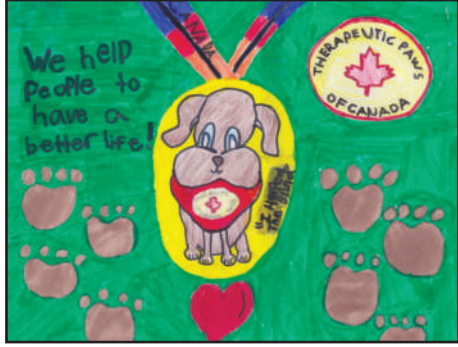
Mercedes Schweyer, Grade 4