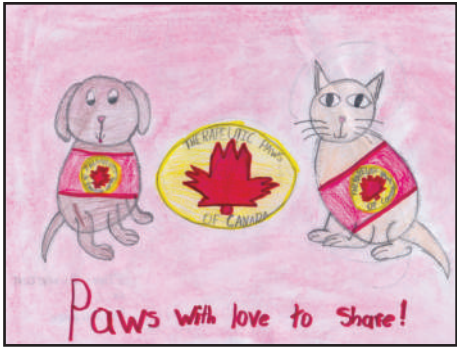
Ethan Schwartzkopf, Grade 5