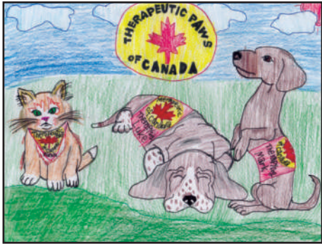
Kai Tofflemire, Grade 8