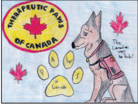
Hattie Kragten, Grade 5