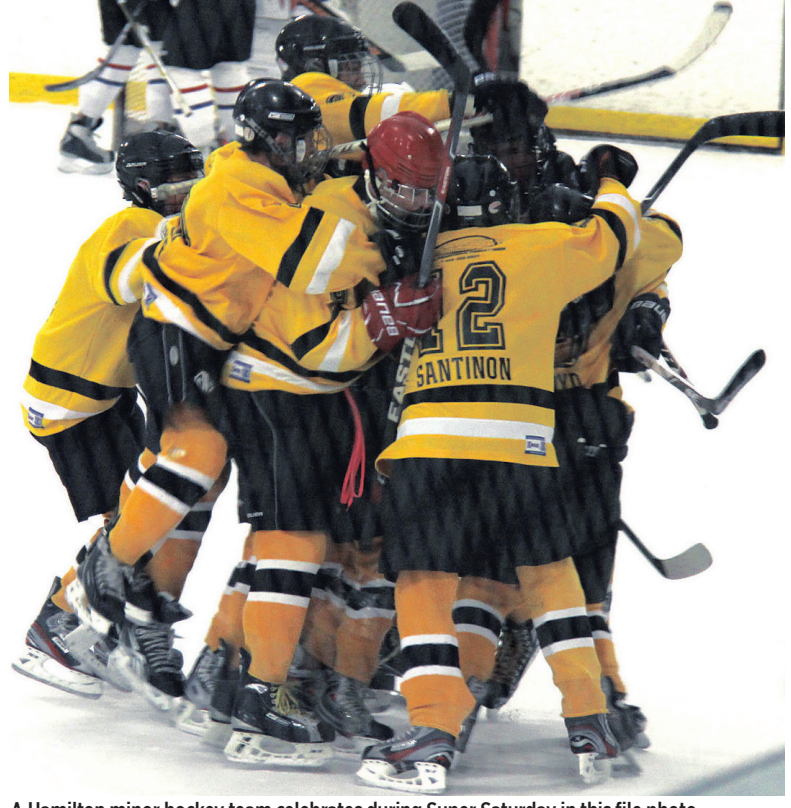
A Hamilton minor hockey team celebrates during Super Saturday in this file photo.

ciations say that's led to some kids being forced to play house league, or leaving for nearby unsanctioned private minor hockey programs. In some cases, less qualified players are moved up to play rep so a team can exist.