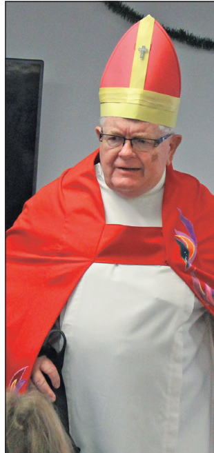
Kids at the event got to learn about Saint Nicholas of Myra's life and his legacy of generosity.