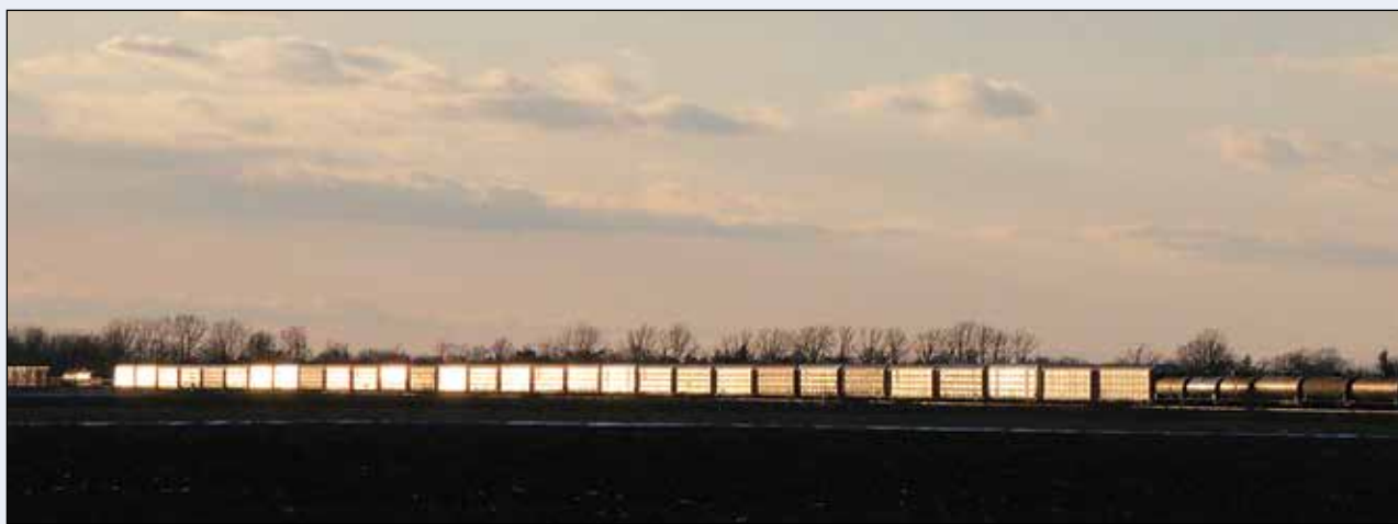
As we move into spring, the days are getting longer and the sunsets more colourful. A freight train passes over Mandaamin Line near Confederation in the late evening sun.