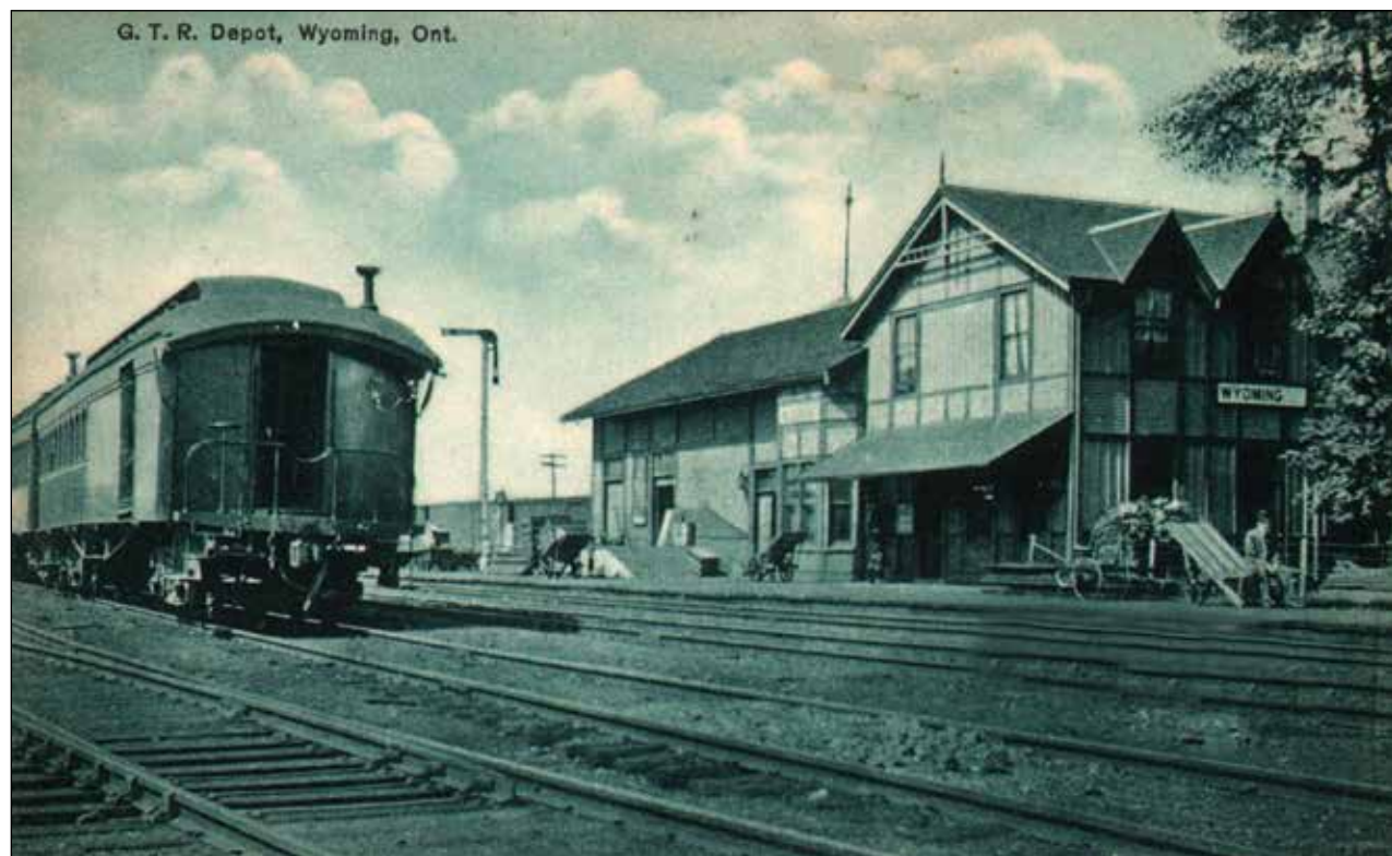
A view of the Wyoming train station, with a passenger car on the left. There is a lot of detail on the loading dock including a man sitting on a cart on the right side of the photo under the Wyoming sign. The picture was taken around 1910.