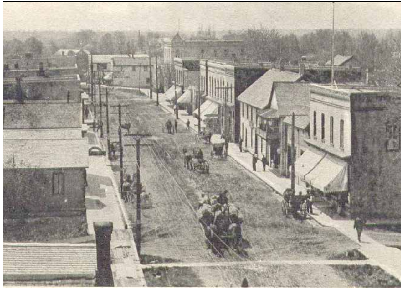
MAIN ST., ALVINSTON, ONT.

This is a photo of Alvinston's main street. Archibald Gardner a Scotsman, first came to the area in 1835. In 1880, Alvinston become an incorporated village. At that time Alvinston had two flour mills, one stove factory, one planing mill, one foundry, one cabinet factory, four wagon and blacksmith shops, two brickyards, ten stores, four hotels, one livery stable, one school of two rooms, five churches and a township hall. It's not clear when this photo was taken.