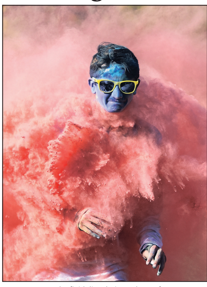
A runner crosses the finish line during Colours of Hope.