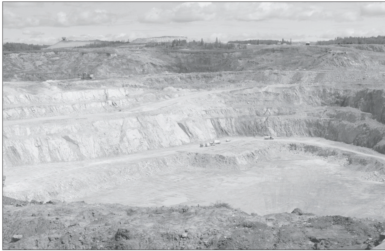
New Gold's open pit is expected to be depleted by early 2025. Currently they are stockpiling lower grade ore from the open pit that will be processed at the mill when underground operations begin in 2022.