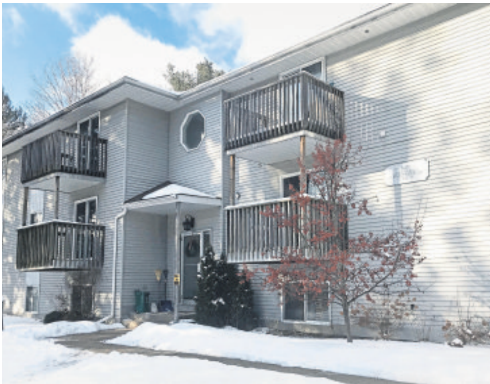
The exterior of building two at 129 Alice Road in Bracebridge.

"I don't want to move," he contended after the meeting. "I feel a lot better now that we have legal advice on what to do."