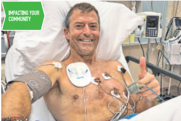
IMPACTING YOUR COMMUNITY