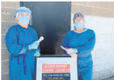
Staff at the ready outside the Parry Sound COVID-19 testing centre, at the back of the Parry Sound Mall.

"(A test) is a snapshot ... it's more important for people to monitor for symptoms and of course get tested if have symptoms or confirmed known exposure, as in someone in the home,"