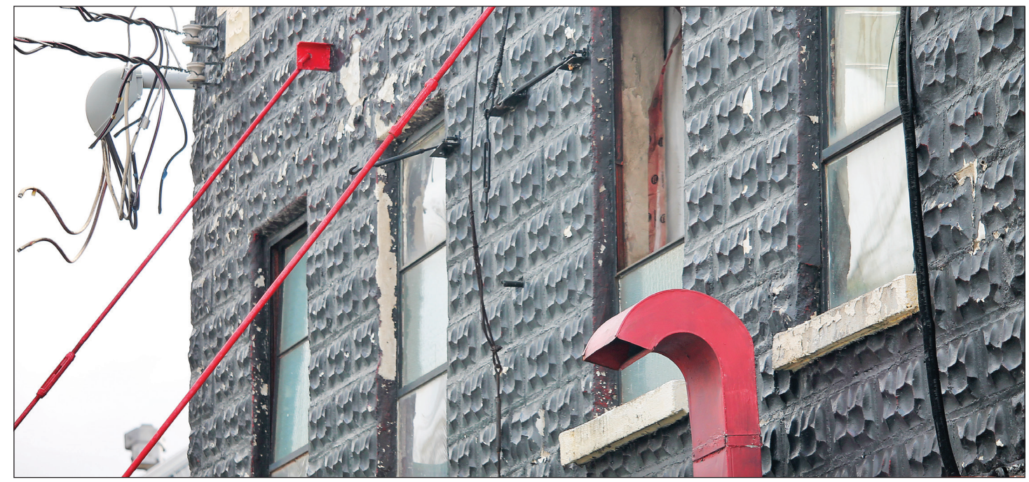
Missing windows, such as this one on a building on Water Street, are attracting pigeons to downtown Minden.