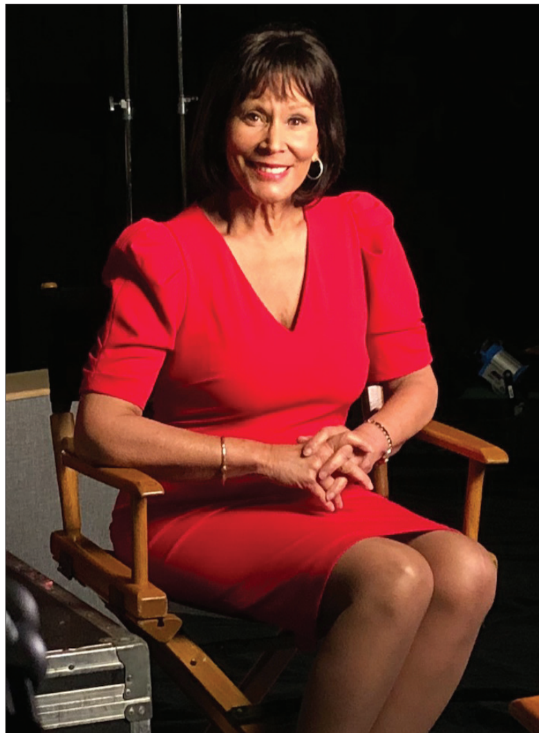
Jennifer Hosten went back to school and received a Master's Degree in Psychology in 2011. She recently retired from her career as a psychotherapist and now lives in Oakville.

"There are many things we need to not take for granted," she said. "We need to not be afraid to speak up when we see injustice or inequality. It's time for us to be brave. It's time for us to walk the talk."