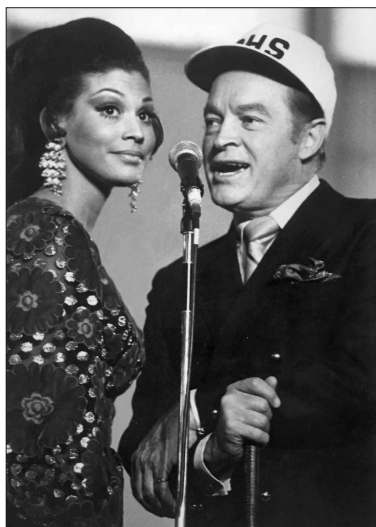
After winning the 1970 Miss World contest, Jennifer Hosten accompanied Bob Hope, to visit U.S. troops in Vietnam.

race would be an issue in the contest and was taken back by the reaction to her victory.