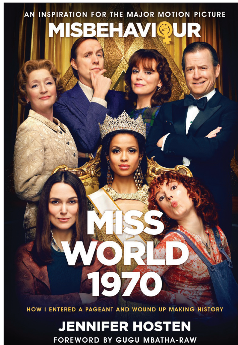
Jennifer Hosten also released her autobiography this year. While the movie Misbehaviour focuses on the 1970 Miss World pageant and ends with the pageant, Hosten said the book details things that happened in her life after winning the contest.

"A few years ago, I watched the movie Belle with a friend," Hosten said. "Gugu was very good in that film. My friend said afterward, 'My goodness, she could play you.' When I found out she would be playing me, I was very happy."