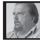
GWYNNE DYER Global Outlook on World Affairs

The judge based her decision on the fact that Shell is violating Dutch law and the European Convention on Human Rights that guarantee the 'right to life.' The company