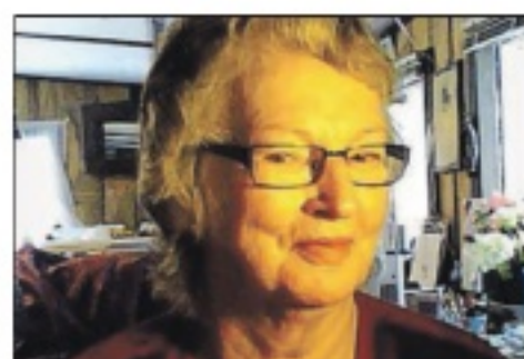
ANNA BRANCH Column