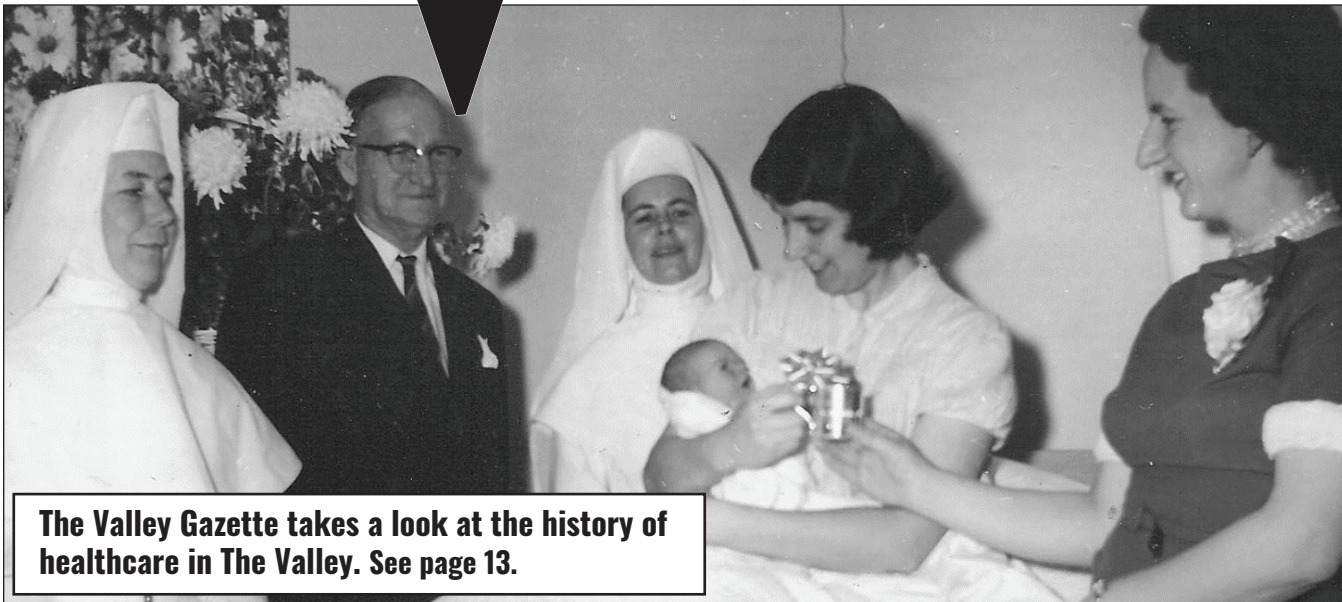
The Valley Gazette takes a look at the history of healthcare in The Valley. See page 13.

Wednesday, April 7, 2021 Vol. 12 - Issue 14 LOCAL NEWS, LOCAL PEOPLE. OUR COMMUNITY NEWSPAPER.