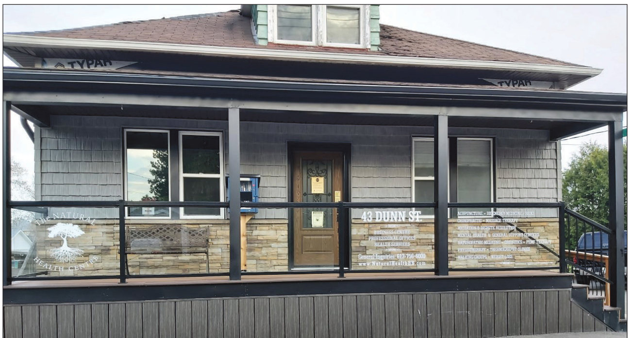
Barry’s Bay Natural Health Care Centre Houses many natural health practitioners under one roof.