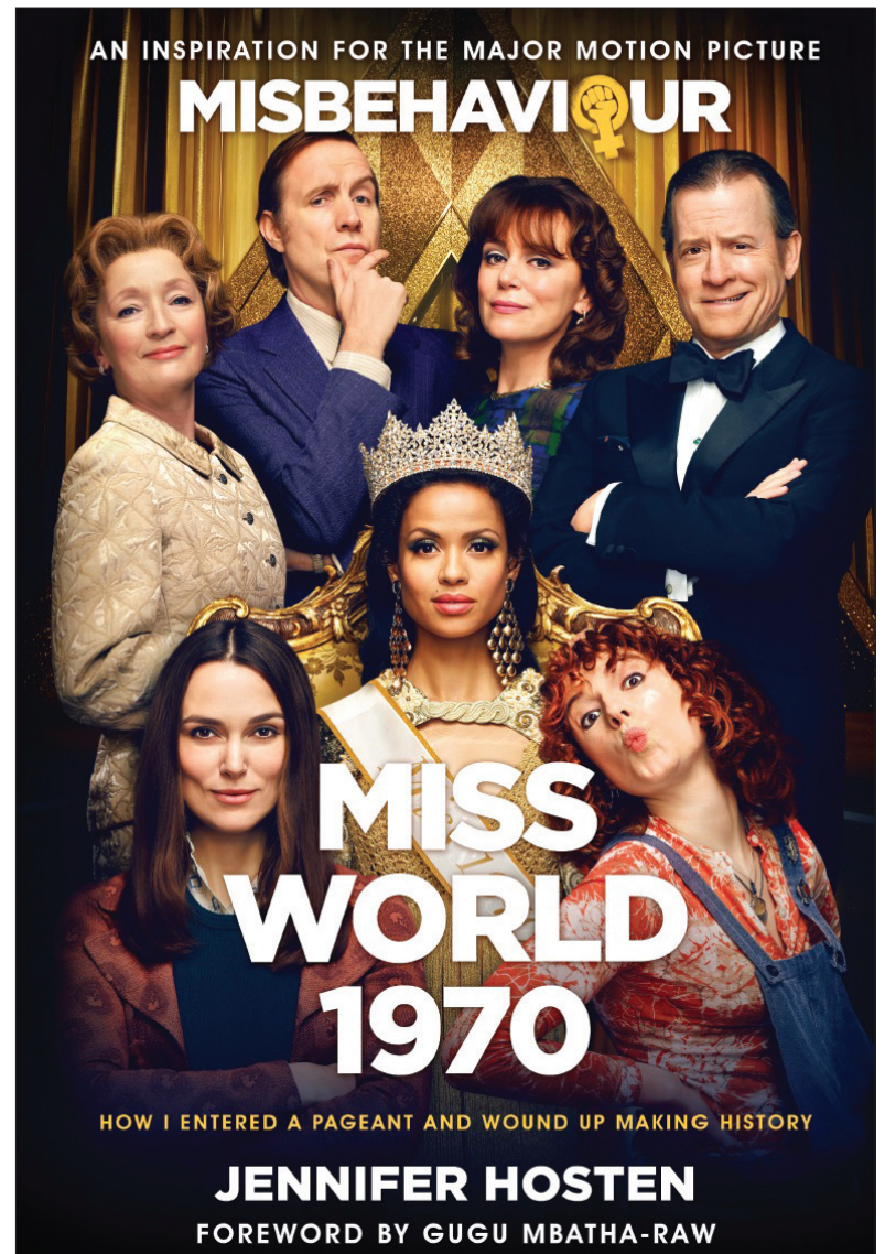
Jennifer Hosten also released her autobiography this year. While the movie Misbehaviour focuses on the 1970 Miss World pageant and ends with the pageant, Hosten said the book details things that happened in her life after winning the contest.

"A few years ago, I watched the movie Belle with a friend," Hosten said. "Gugu was very good in that film. My friend said afterward, 'My goodness, she could play you.' When I found out she would be playing me, I was very happy."