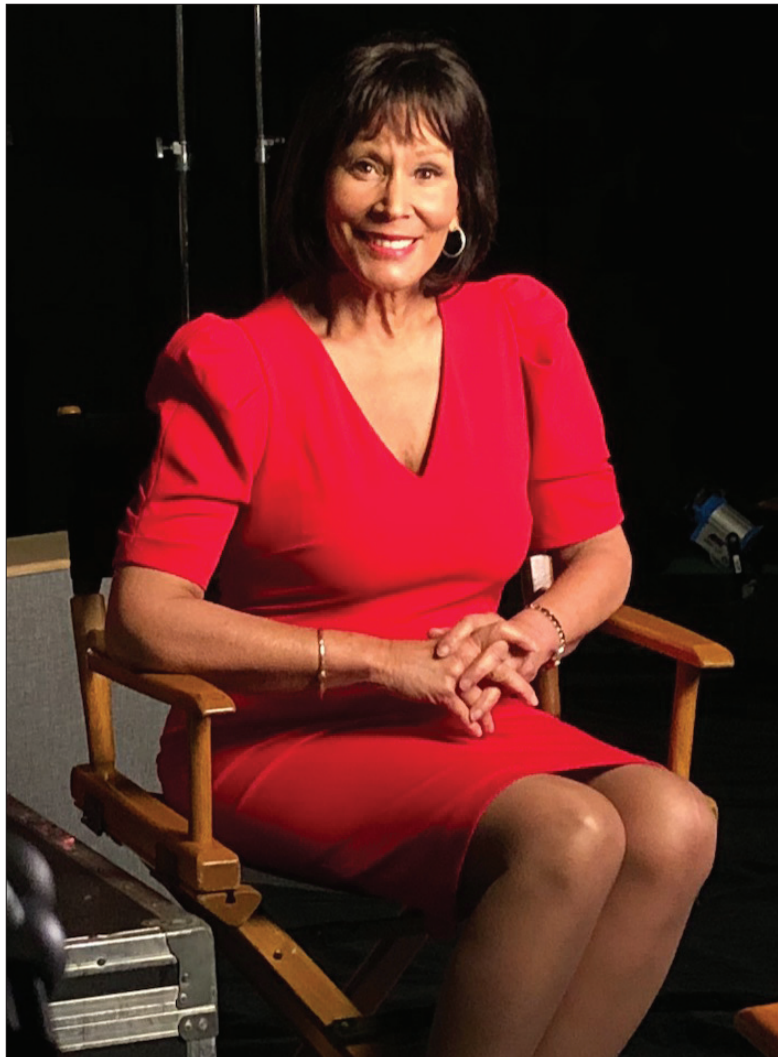
Jennifer Hosten went back to school and received a Master's Degree in Psychology in 2011. She recently retired from her career as a psychotherapist and now lives in Oakville.

"There are many things we need to not take for granted," she said. "We need to not be afraid to speak up when we see injustice or inequality. It's time for us to be brave. It's time for us to walk the talk."