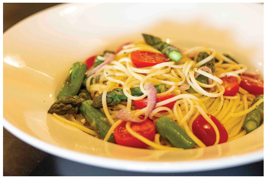
Spring asparagus prima vera with garlic olive oil sauce.

Complete first thing is asparagus L soup, but there are so many ways to enjoy asparagus. We make asparagus frittata, roasted asparagus pizza. It's great in vegetable lasagna and we'll serve it as the side vegetable to our mains. My mother was a chef and she liked it in an omelette with leeks, some red peppers for colour. At home, I just grill it with a little olive oil, salt and pepper. You want to get the full taste of the asparagus. As for wine, I suggest something white, light and citrusy. A Niagara off dry Riesling would be a good choice."