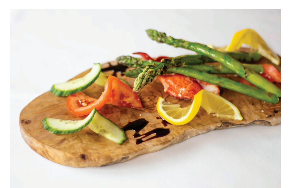
Grilled lobster asparagus with fig balsamic and Italian herb olive oil.