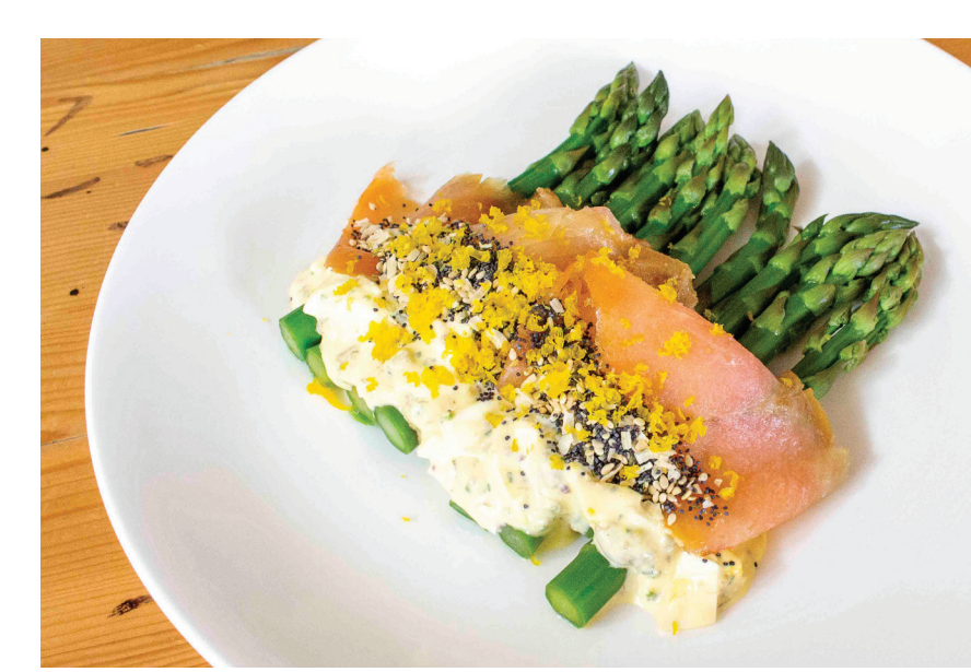
Poached Thwaites Farms asparagus with vodka smoked salmon, sauce gribiche, everything bagel crunch, cured egg yolk.

\mathbf{G} \mathbf{T} t's a sign of things to come, you get tired of braising things all winter! There was a lineup at Thwaites today, I was getting two cases. You don't have to do much to it. I like to just blanche it, in water as salty as seawater, then put it in an ice bath if you're not serving it right away. Add butter, salt and pepper, and eat it. It's great combined with other ingredients foraged in early spring, like morel mushrooms, fiddleheads and ramps. We'll be all things asparagus at the restaurant, you'll see it in our new daily takeout menus, for sure. I love it grilled, with a crisp Niagara Chardonnay, or even a dry Rosé."