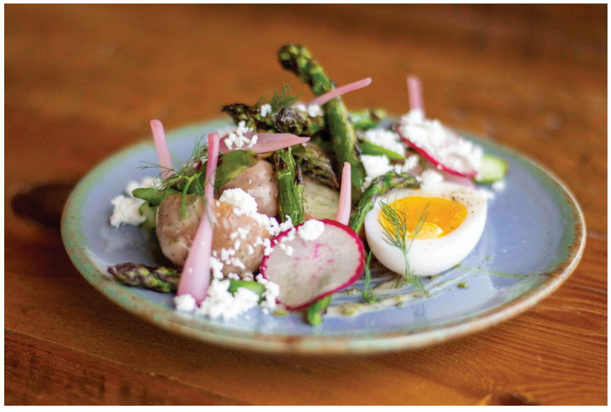
Charred Ontario asparagus, golden heart potato dressed with a fresh dill and mustard vinaigrette, soft cooked egg, sliced radish and sheep milk feta.

table at home tonight, just grilled. People