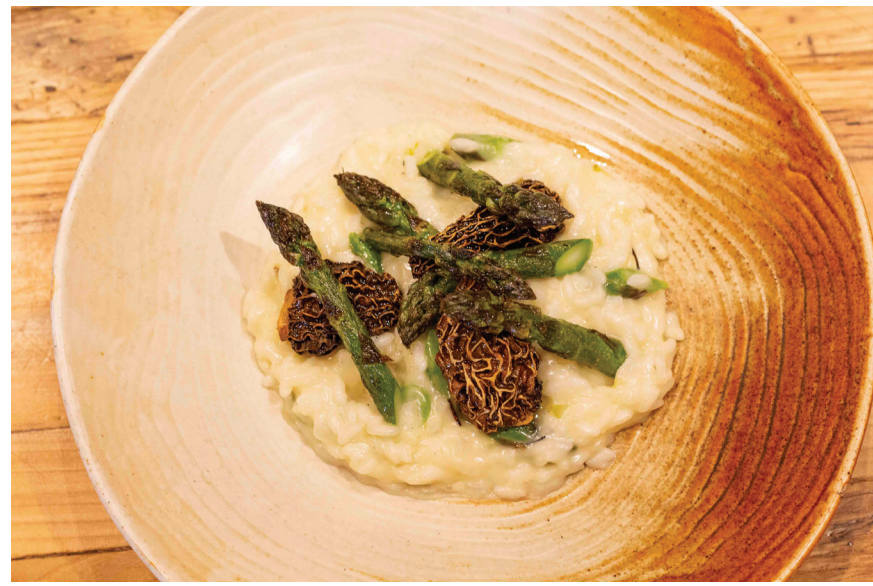
Asparagus risotto with foraged morel mushrooms.