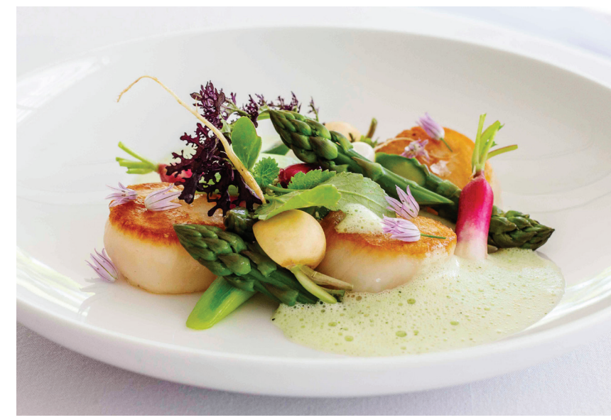
Pan roasted sea scallops with Thwaites Farms asparagus, breakfast radish, chive blossom and spring leek veloute.

66 A sparagus is the first real thing available in the spring, so I like to incorporate it into as many dishes as possible. It's so good in a salad with prosciutto, grilled with butter sauce or hollandaise, or just blanched and buttered Another favourite is chilled local asparagus with fior di latte mozzarella, brown butter crumbs and sherried vinaigrette. The way my mom used to do it at home was in an aluminum pan with butter on the edge of the barbecue, so it cooked right in the butter. We always get our asparagus from Thwaites Farm. It's unbelievable how much great asparagus they grow. Asparagus and wine can be a tricky match, but I'd say something greener, like a Sauvignon Blanc or Riesling."