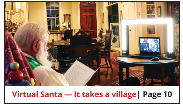
Virtual Santa — It takes a village | Page 10