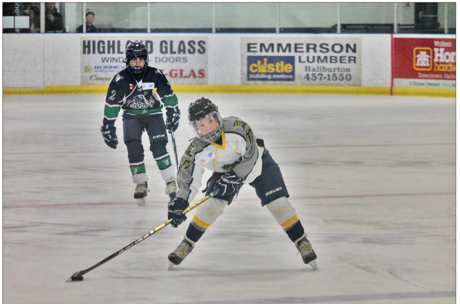
A Storm player in action pre-pandemic.