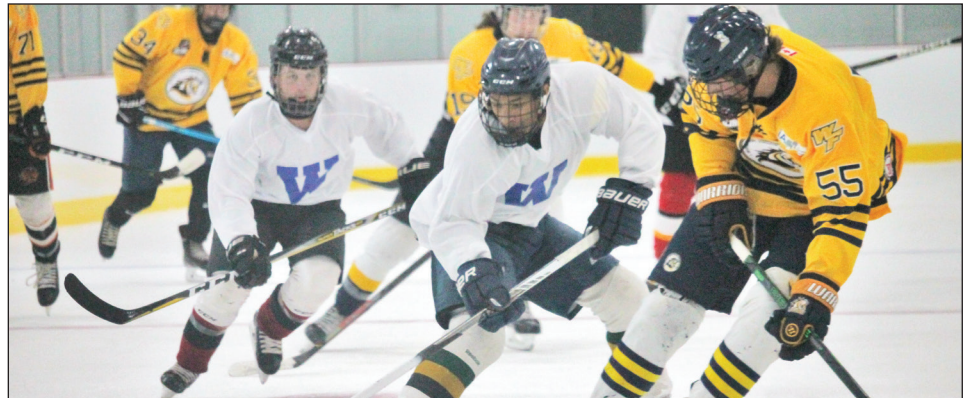
Speeding down the rink during a preseason scrimmage.