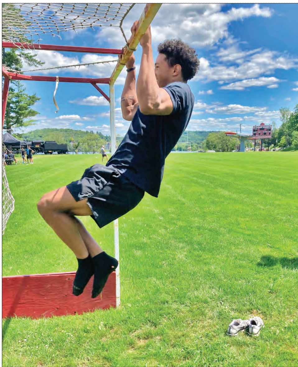
The Haliburton County Huskies held fitness training in Haliburton in mid-July as the squad prepares for the upcoming 2021-22 hockey season. Photos submitted.