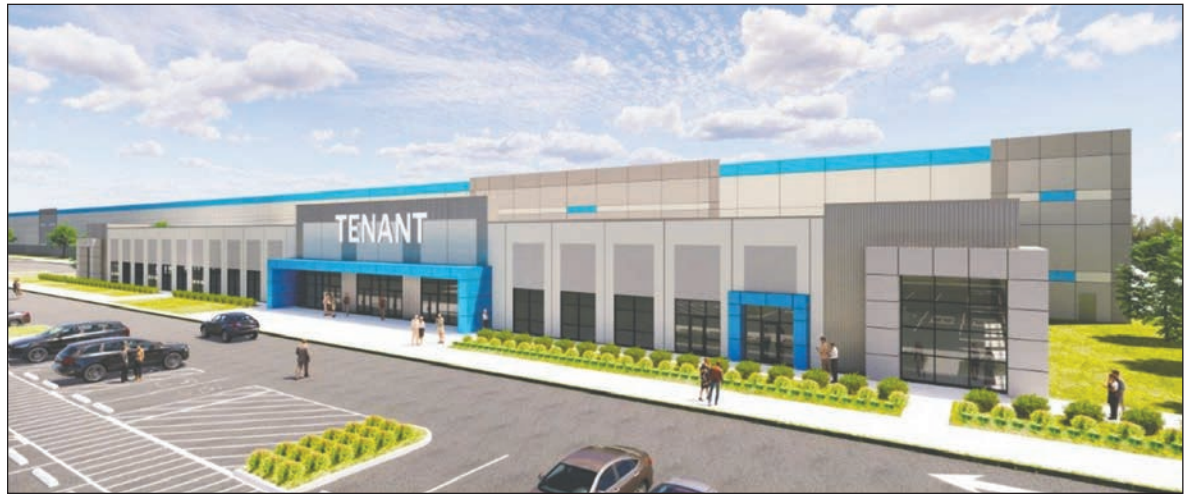
Concept warehouse design.

Apply with resume to info@denmech.ca or call 519-654-9732