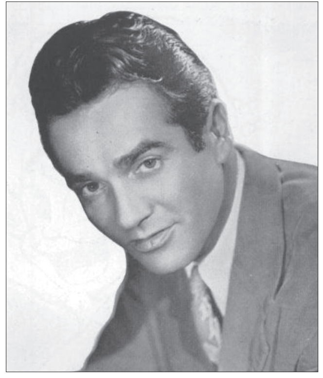
Famous musician Gene Krupa was a visitor to the Manotick Tea Room and he even kept some equipment in the basement of the building.

The old Manotick Tea Room building is gone now. As construction crews took it down, the memories, ghosts and legends were squeezed out of the remains in the