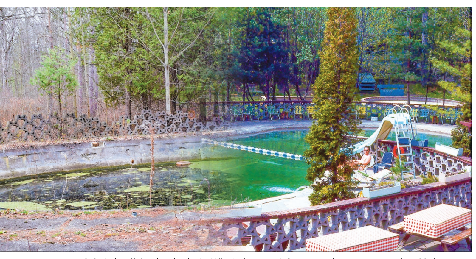
FADING INTO THE BUSH Right, the famed kidney shaped pool at Sun Valley Gardens, in 1974. Left, its remains in late 2020, as nature reclaimed the former resort.

She then launched into a wild tale about how the year before, while driving home from a trip to Cape Cod, my father had made a mysterious detour on a road that ended up with them right at the wooden gates of Sun Valley Gardens.