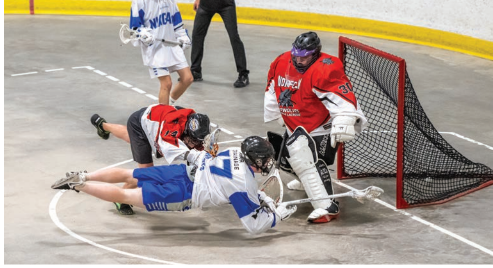
A Niagara Thunderhawks player scores one of the team's 12 goals against Simcoe last Thursday at the Meridian Credit Union arena in Virgil.

The Thunderhawks' stellar defence was able to smother their opponents' fleeting attempts at generating scoring chances, while their own offence got down