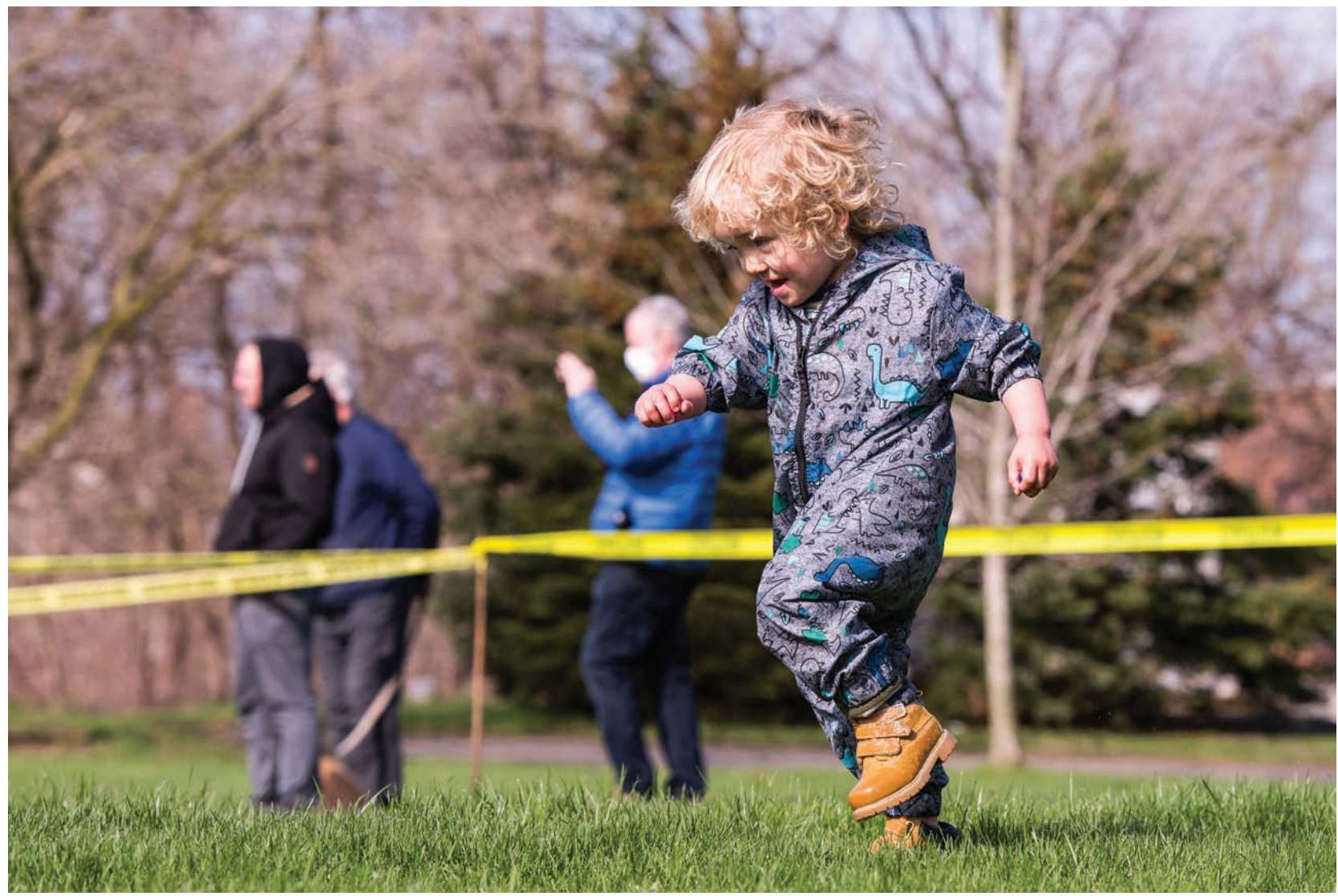
A child excitedly runs as the Kinsmen kick off the popular egg hunt at the community centre on Saturday.

Traffic was brisk at NOTL wineries over the Easter long weekend. In some cases, the volume of visitors topped pre-COVID num-