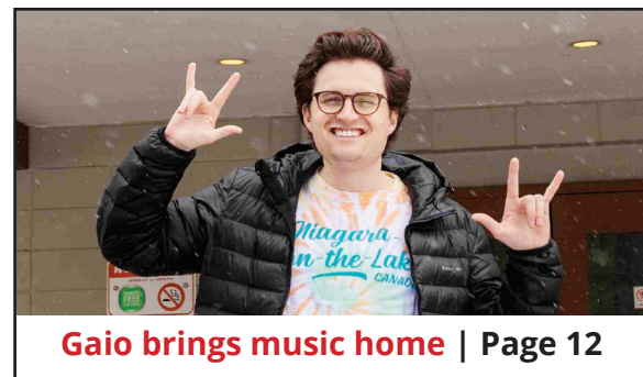
Gaio brings music home | Page 12