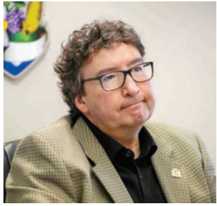
Lord Mayor Gary Zalepa.