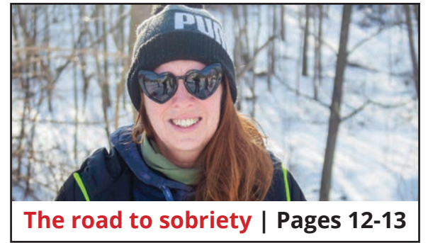
The road to sobriety | Pages 12-13