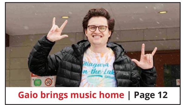
Gaio brings music home | Page 12