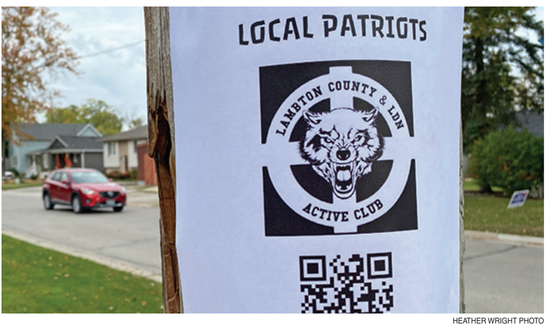
The Active Club listed on a sign found on James St. is one of many waiting for entry into a white supremacy group according to an anti-hate researcher.