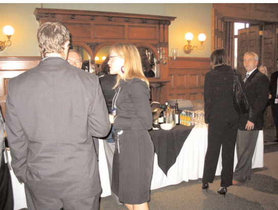
Publishers, MPPs, Civil Servants mingling at the reception.

Members had the opportunity to meet privately with 18 of their local MPPs including the Ministers of Agriculture, Food and Rural Affairs; Government Services; Citizenship and Immigration; Northern Development and Mines; Natural Resources; and Tourism. Publishers disc-