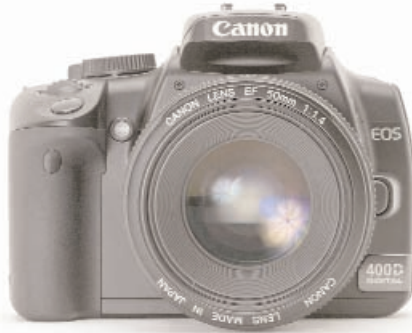
Canon 400D-front: The Canon 400D, also known as the Rebel Xti, offers 10 megapixel resolution.

In September, the Rebel XTi arrived. The XTi is a 10 megapixel camera, up from the 8 megapixel Rebel XT and the 6 megapixel Rebel. In addition to the higher