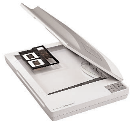
Epson_v350: The new Epson Perfection V series scanners offer higher resolution at lower prices.

The V series offers higher resolution at the same or lower price than its earlier models. I suspect Epson has a hit on its hands.