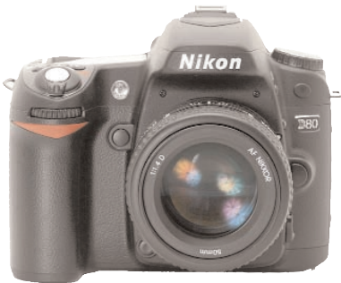
Nikon Front: The Nikon D80 replaces the D70, a favourite of many newspapers for the past three years.

Then in 2005, Canon released the Rebel XT (350D). I was so impressed, I shelled out $1000 from my own pocket to get one of my own.