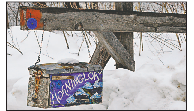
The Morninglory mailbox on the hills outside Killaloe.