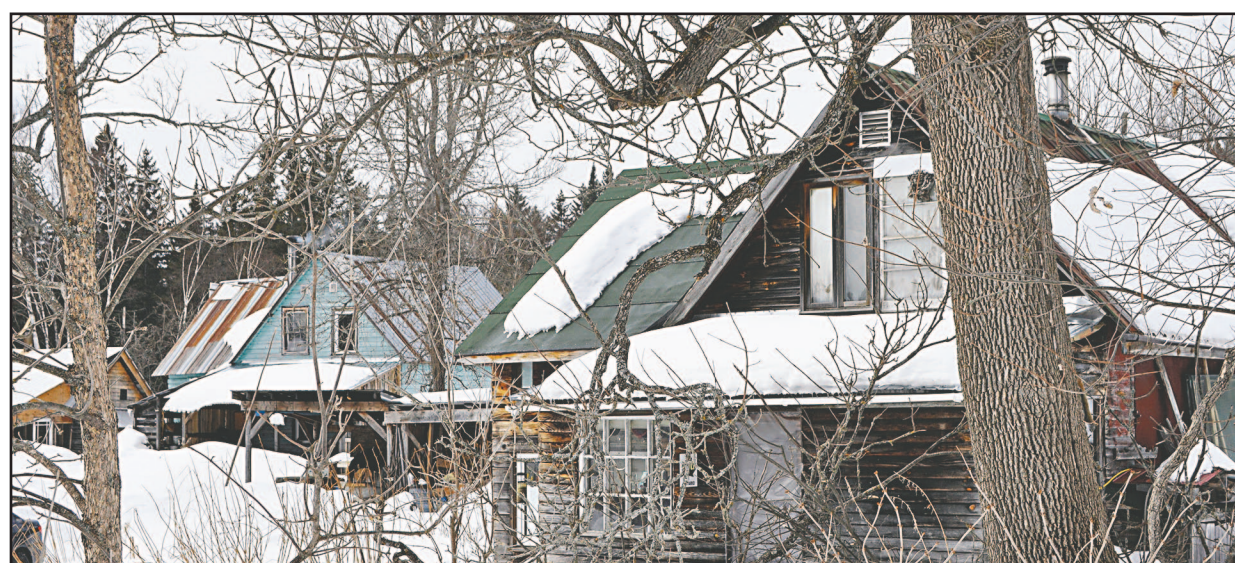
There are several dwellings on the Morninglory property. About 20 people live there now.