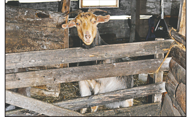
A friendly goat in the barn at Morninglory.