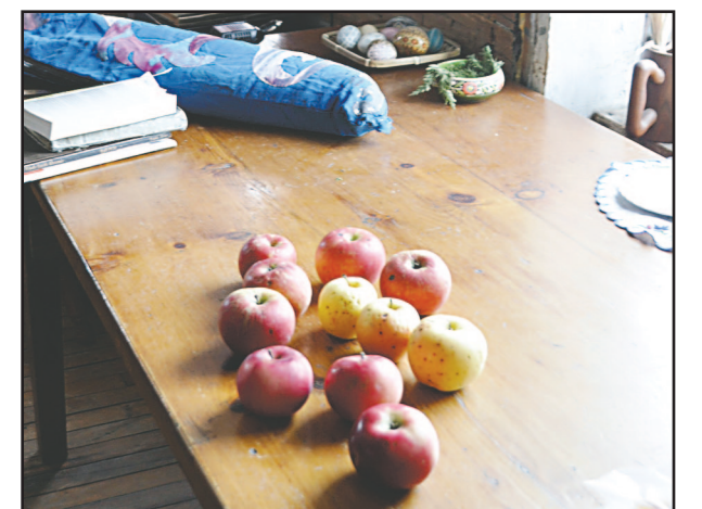
Apples at Morninglory taken out of cold storage.