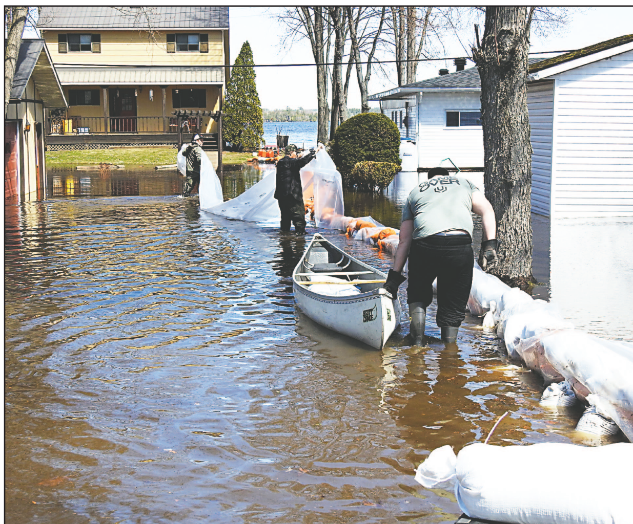
Residents along River Drive are experiencing flooding from the swollen Ottawa River. On Tuesday morning, the main bridge that carries 17,000 vehicles a day to Garrison Petawawa was closed due to high river levels.