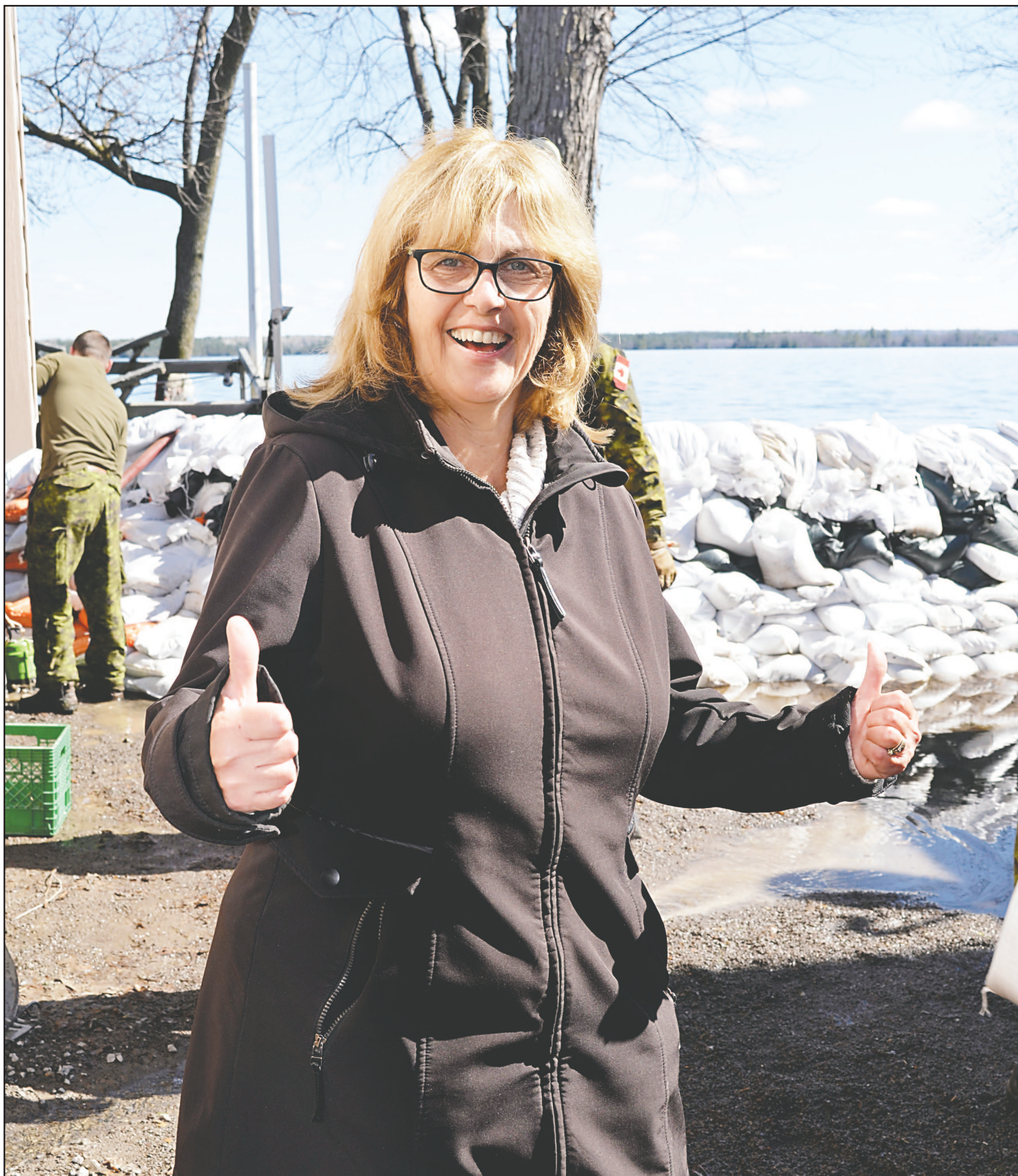
Thumbs up for our soldiers!

"For the second time in two years, the residents of Renfrew County are being challenged by the unknown of what is going to happen and people are coming out in droves to volunteer," she said. "Many are complete strangers working beside each other, filling sandbags that get delivered to people they likely don't even know and we are all in this together no matter what happens over the next little while."