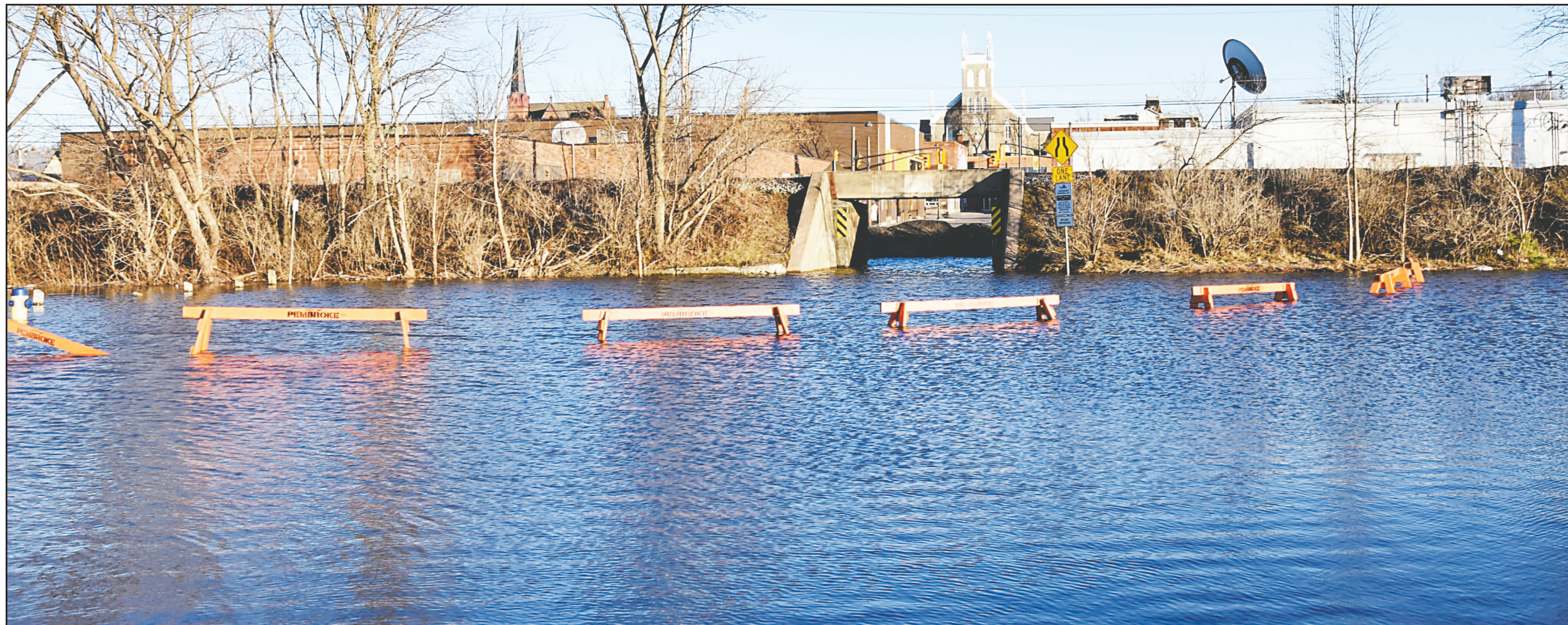
The parking area at the Pembroke waterfront used by many employees in the downtown core and by Algonquin College students and faculty remained flooded on Sunday evening. Loads of sand were dumped under the old railway trestle to prevent water from flooding onto Lake Street.