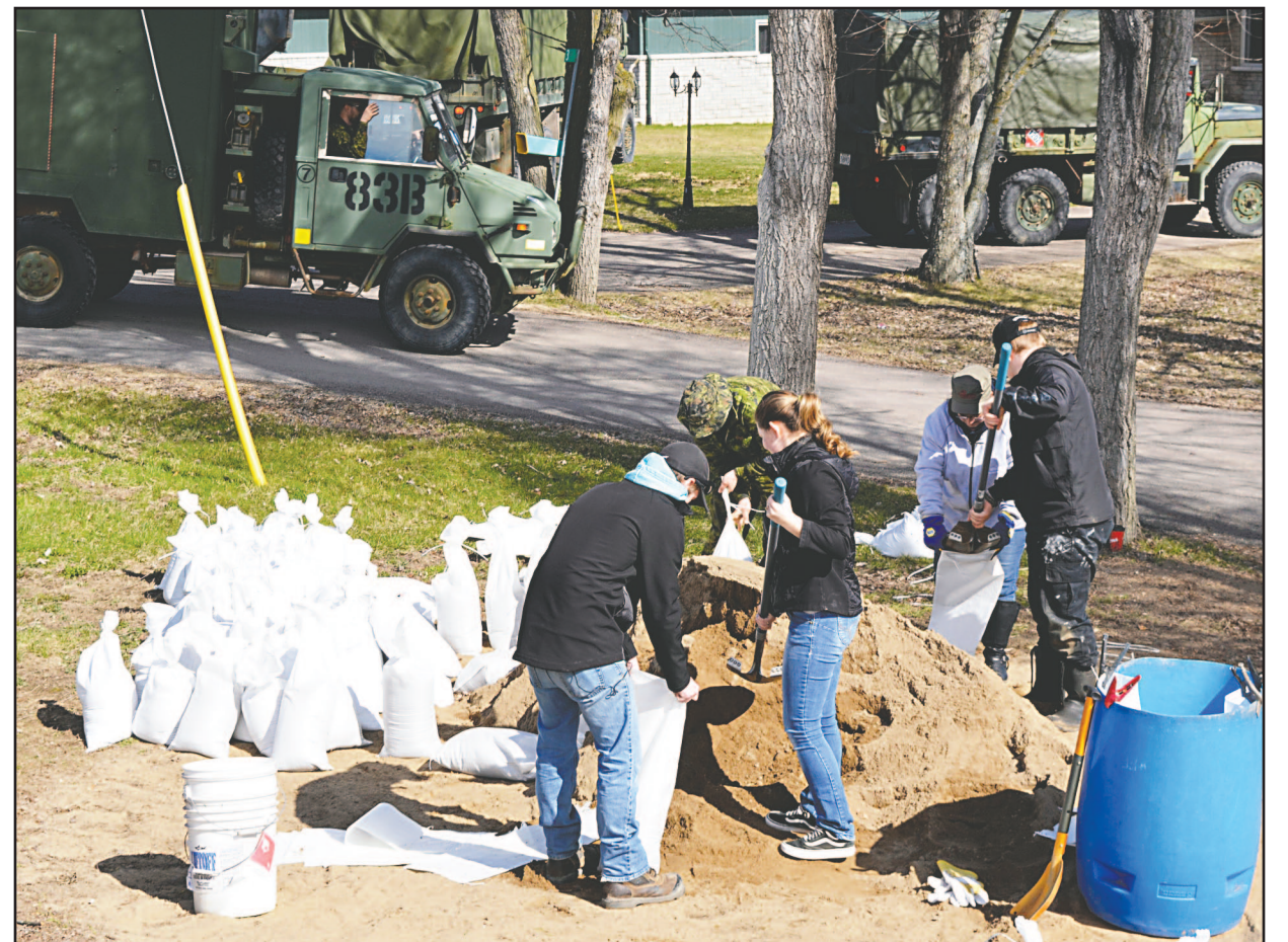
Soldiers of 2 RCHA working beside family members making sandbags was a common sight along River Road in Horton Township this week. More than 300 soldiers were dispatched from Garrison Petawawa over the weekend to assist areas most affected by the recent flooding.