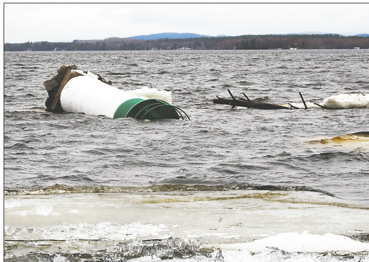
The lighthouse at the Pembroke Marina fell prey to the high water and ice that was pushed inland by heavy winds on Friday night.