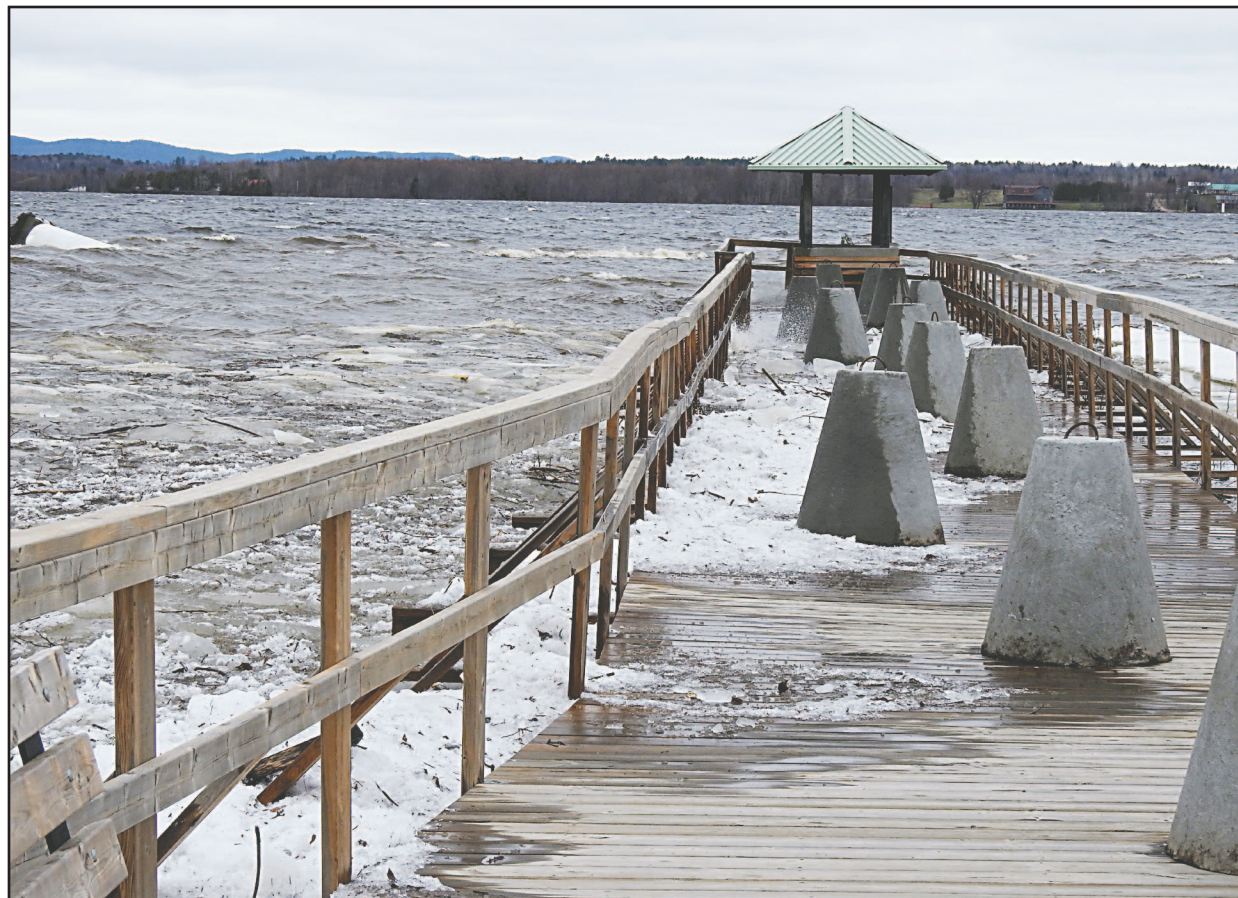
Heavy cement pylon-like blocks were placed along this boardwalk to keep it in place at the Pembroke waterfront last week. The area remained flooded as of press time Tuesday.

He said many employees of the downtown core use the parking lots at the waterfront and they are now using the parking area at the Pembroke Memorial Centre and another area.