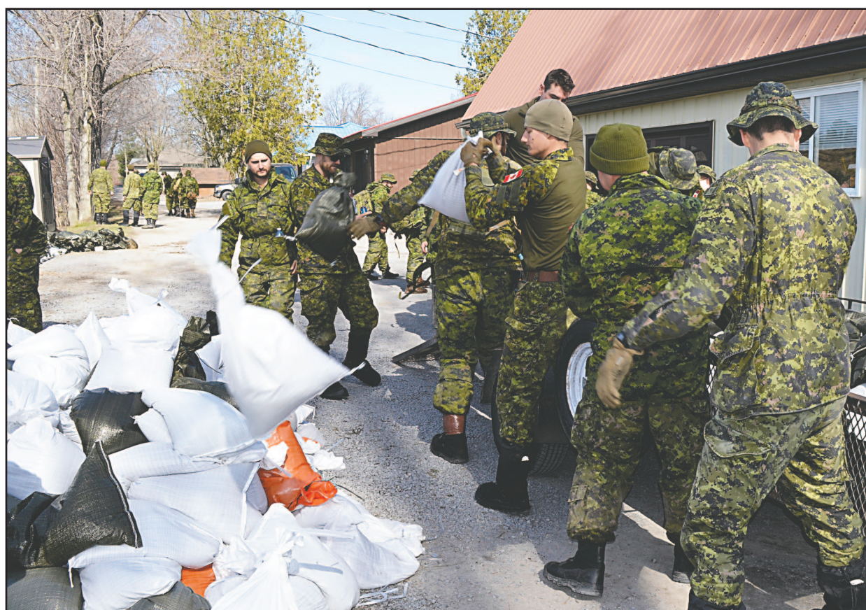
Members of 2 RCHA, who have set up a base camp at Ma-Te-Way Activity Centre in Renfrew, were transported by personnel carriers to sections of Horton Township to assist residents affected by flooding along the Ottawa River. One of the main tasks was to help build sandbag barriers along the river.