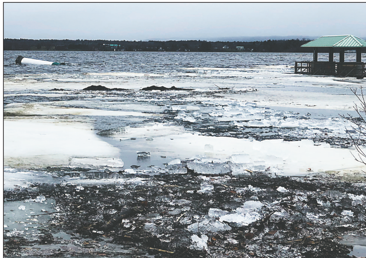
There was still plenty of ice along the shore of the Ottawa River that was pushed inland by the rising water and high winds over the weekend that caused the collapse of the iconic lighthouse, seen at the left floating.