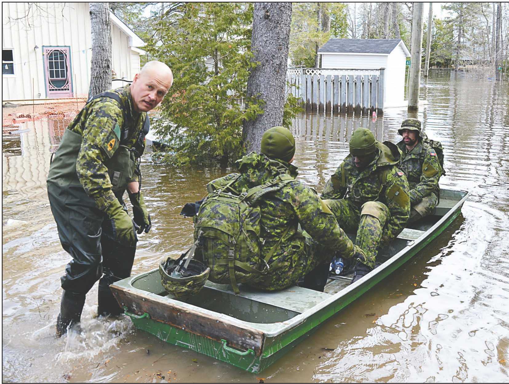
Members of the 2 Royal Canadian Horse Artillery (RCHA) use a small boat belonging to a Lola Lane resident to navigate their way to some homes damaged by flooding along the Ottawa River. Lola Lane was one of several roads covered in water in Horton Township over the last week. The township was one of several to declare a state of emergency.

"I can't explain it, but I am really not sure why this is happening, maybe it is the bureaucrats in Toronto at OPG who don't know what they are doing, but years ago there were local people who worked for OPG and