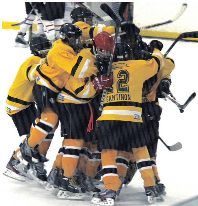
A Hamilton minor hockey team celebrates during Super Saturday in this file photo.

ciations say that's led to some kids being forced to play house league, or leaving for nearby unsanctioned private minor hockey programs. In some cases, less qualified players are moved up to play rep so a team can exist.