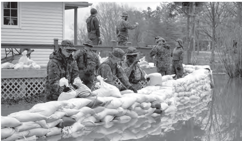
About 40 military reservists work to shore up a sandbag wall around a home in MacLaren's Landing on May 2. Residents received much-needed help from the Canadian military in several waterfront communities in West Carleton.