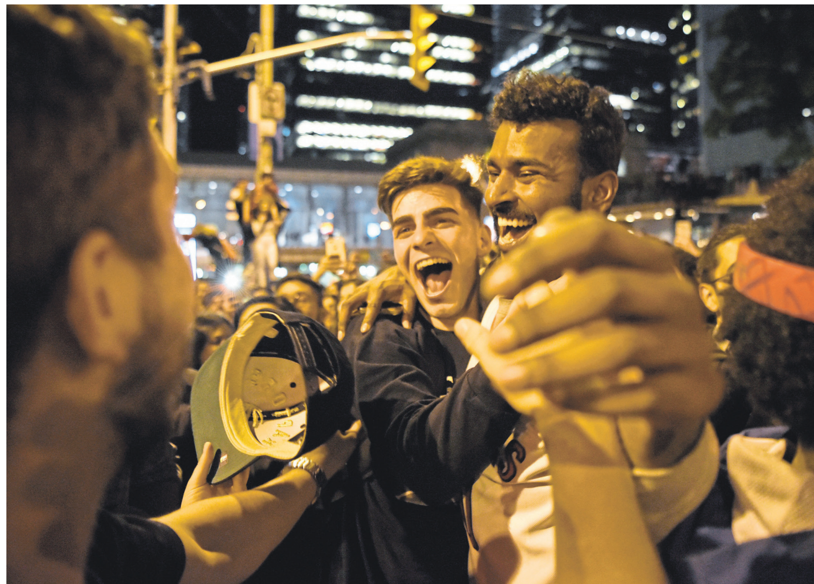
Toronto Raptors' fans celebrate their first NBA championship after the Raptors' 114-110 victory over the Golden State Warriors in Game 6 of the NBA Finals last Thursday.