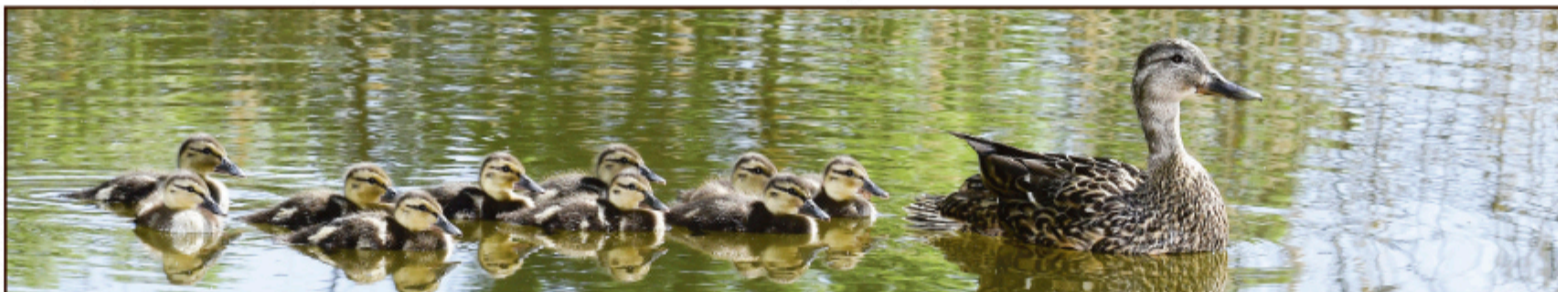
A FEMALE MALLARD leads a brood of 10 ducklings across Lake Chipican