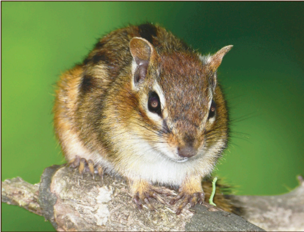
WHAT HAVE WE HERE? After crawling along a branch, an inchworm caterpillar stands up and appears to engage in a stare-down with a chipmunk in Canatara Park last week. Bad move. The caterpillar moments later became a quick snack.