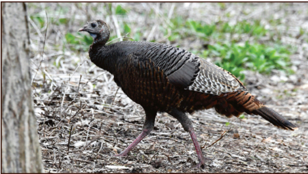
A WILD TURKEY goes for a stroll around the southeast corner of Lake Chipican. The last native wild turkey in Ontario was recorded in 1902, but a reintroduction of the birds in the 1980s has been wildly successful.