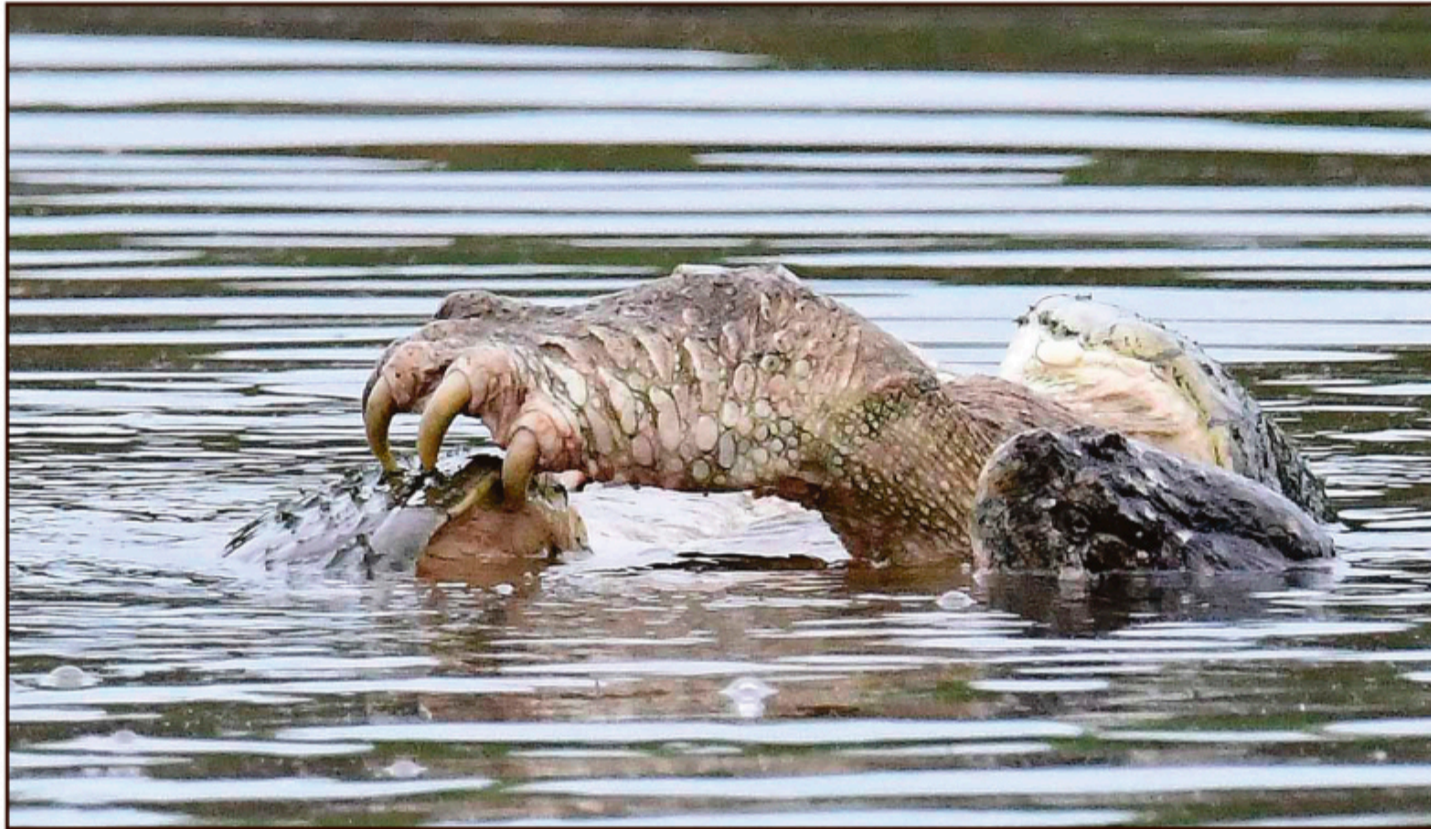
THE CREATURE FROM THE BLACK LAGOON RETURNS! Actually, these impressive claws belong to a massive female snapping turtle attempting to mate with a reluctant male in Lake Chipican on June 9. said the dinosaur-like creature, which he first spotted last years and nicknamed Behemoth, pursued and grabbed at the smaller male until it finally agreed to co-operate. A biologist who has studied photos of Behemoth said she could be as old as 100 years.

So today we present more of his close encounters of the bird, the furred and undeterred kind.