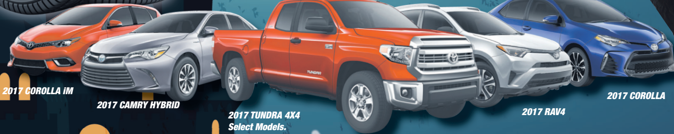
2017 COROLLA iM

**10 - MIDNIGHT all in-stock pricing is SOOOOOO SCARY I can't mention it!!